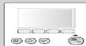
MAIN REMOTE CONTROLLER